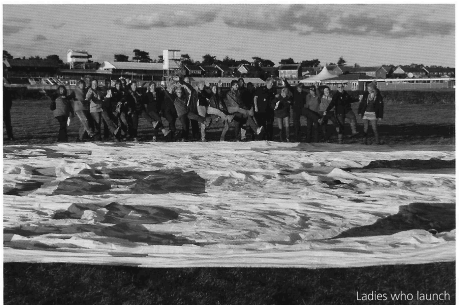
Ladies who launch